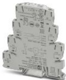
Timer relay with off delay (with control contact) and an adjustable time range (0.3 min - 30 min), with screw connection

Please be informed that the data shown in this PDF Document is generated from our Online Catalog. Please find the complete data in the user's documentation. Our General Terms of Use for Downloads are valid ( http://phoenixcontact.com/download )