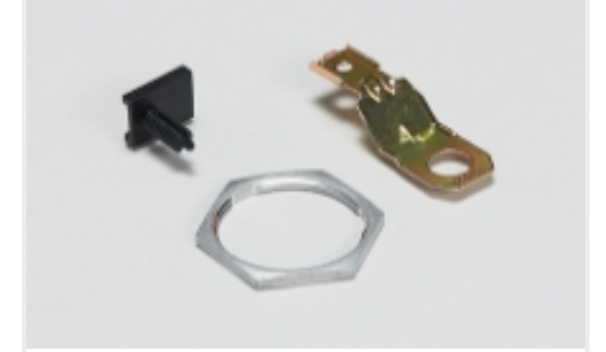
Other Automotive Connector Accessories(16)