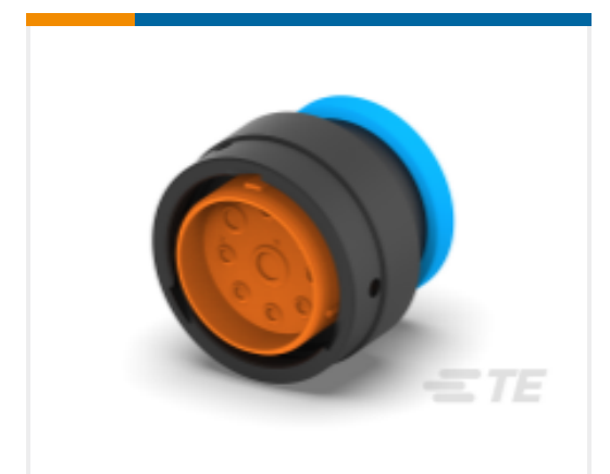
TE Part #HDP26-24-9PE-L017 PLG, 9P, BLK, E, RNG, 4/8/12, P