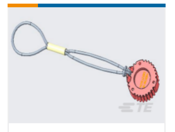
TE Part #HDC16-9-JDL DUST CAP, 9P, REC, GRY, LANYARD, HD10