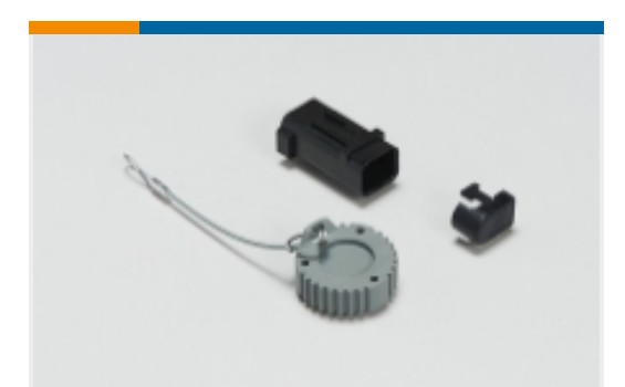
Automotive Connector Caps & Covers (107)