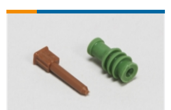
Automotive Seals & Cavity Plugs(5)