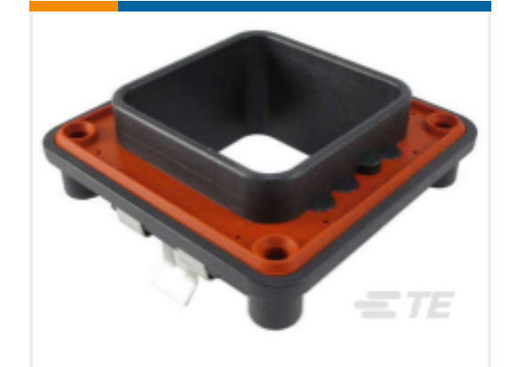
TE Part #DRBF-2B FLANGE, MOUNT, 60/48P, BLK, B