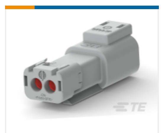
TE Part #DT04-12PB-CE08 DEUTSCH DT Receptacle Connectors