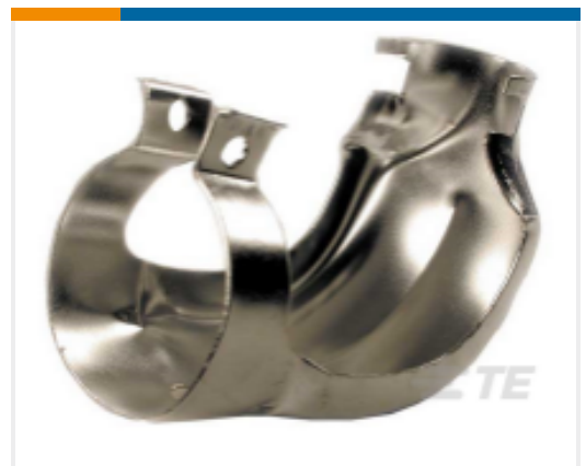
TE Part #WHDS-24-2 STRAIN RELIEF, HD30, 24SZ, RA