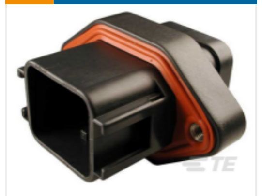
TE Part #DTV02-18PB REC, 18P, BLK, N, FLANGE, B