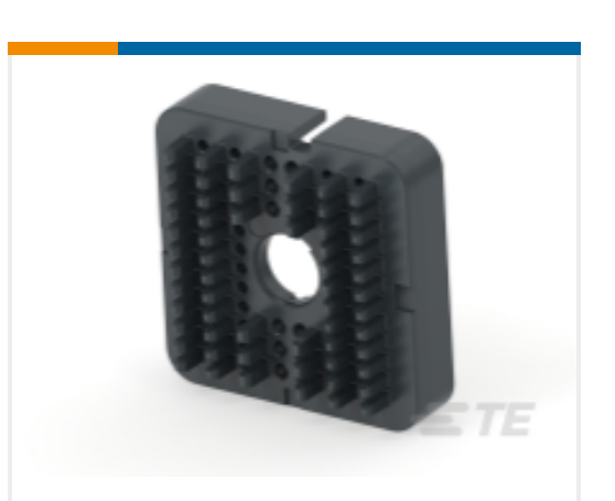
TE Part #WB-60PB WEDGE LOCK, 60P, REC, BLK, DRB, B