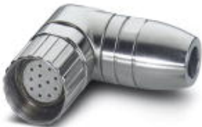
The figure shows the 12-pos. product version

Cable connector, angled, shielded: yes, Screw locking, M23, No. of pos.: 6+3, type of contact: Socket, Solder connection, cable diameter range: 3 mm ... 10.5 mm