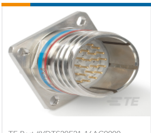
TE Part #YDTS20F21-16AC0000 SQUARE FLANGE RECEPTACLE