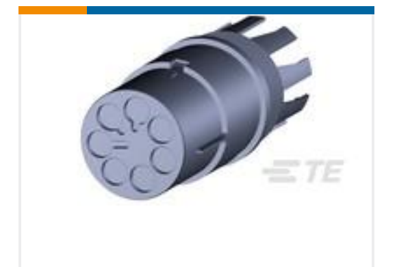
TE Part #293722-1 NECTOR M PIN HSG FREE HANGING 7P CODE A