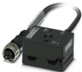
AS-Interface distributor with a high degree of protection, for a branch from one flat-ribbon conductor to a 2.0 m PUR round cable with straight M12-SPEEDCON socket

Please be informed that the data shown in this PDF Document is generated from our Online Catalog. Please find the complete data in the user's documentation. Our General Terms of Use for Downloads are valid ( http://phoenixcontact.com/download )