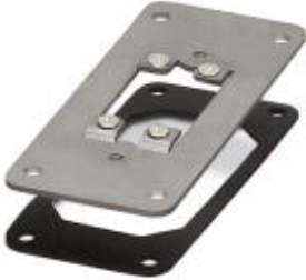
The illustration shows the product version VC-B 10-ADP/2 DSUB 15-M

Mounting adapter plates 1.5 mm thick, with metric countersunk screws, number of inserts: 2x DSUB 25