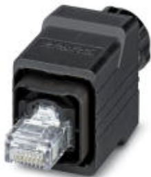
RJ45 connector, IP67, with push/pull interlocking, plastic housing, 1 Gbps, 8-pos., QUICKON fast connection technology, for 26 ... 24 AWG 1-wire and 7-wire conductors

Please be informed that the data shown in this PDF Document is generated from our Online Catalog. Please find the complete data in the user's documentation. Our General Terms of Use for Downloads are valid ( http://phoenixcontact.com/download )