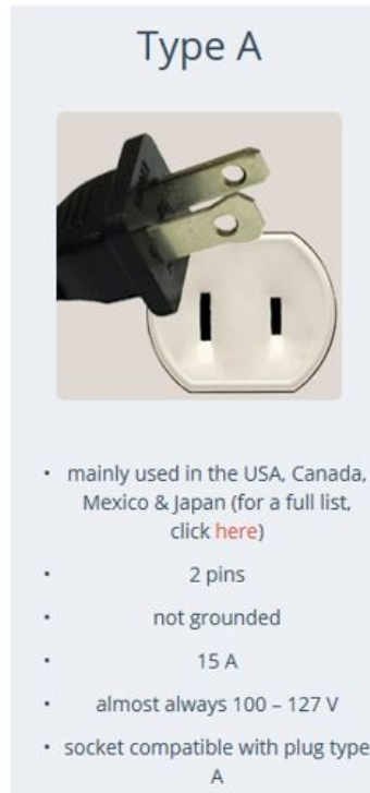
120V AC US PLUG

BATTERY: 18V LI-ION OR LXT RECHARGABLE BATTERY - MAKITA ITEM: BL18XX SERIES. DIMENSIONS: 7.25"L X 6.38"W X 4.25"H, WITH PLUG CONFIGURATIONS SHOWN BELOW/LEFT.