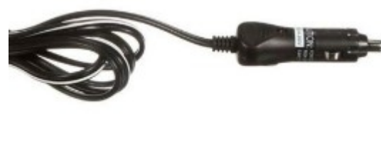
12 VDC AUTO PLUG