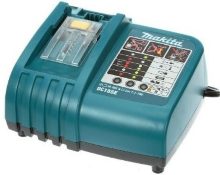
12 VDC AUTO CHARGER SHOWN (120 VAC AND 230VAC UNITS SIMILAR)