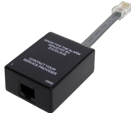
Z-BLOCKER® Z-A431PJ31X-A Alarm Panel DSL Filter