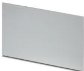
Press-drawn section housings, length: 95 mm, Front plate, color: aluminum color, width: 101.8 mm, height: 2 mm

Please be informed that the data shown in this PDF Document is generated from our Online Catalog. Please find the complete data in the user's documentation. Our General Terms of Use for Downloads are valid ( http://phoenixcontact.com/download )