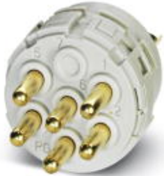
Contact insert, Number of positions: 17, Type of contact: Male connector, Solder connection

Please be informed that the data shown in this PDF Document is generated from our Online Catalog. Please find the complete data in the user's documentation. Our General Terms of Use for Downloads are valid ( http://phoenixcontact.com/download )