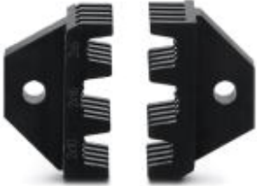
Replacement die for CRIMPFOX 16R TWIN

Please be informed that the data shown in this PDF Document is generated from our Online Catalog. Please find the complete data in the user's documentation. Our General Terms of Use for Downloads are valid ( http://phoenixcontact.com/download )