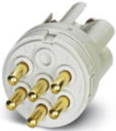
Contact insert, Number of positions: 6, Type of contact: Male connector, Screw connection

Please be informed that the data shown in this PDF Document is generated from our Online Catalog. Please find the complete data in the user's documentation. Our General Terms of Use for Downloads are valid ( http://download.phoenixcontact.com )