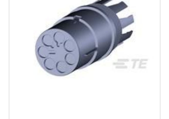
TE Part #293722-1 NECTOR M PIN HSG FREE HANGING 7P CODE A