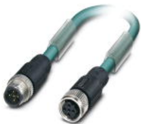
Bus system cable, PROFIBUS, 2-position, PUR/PVC, blue, shielded, Plug straight M12, B-coded, on Socket straight M12, B-coded, cable length: 4 m

Please be informed that the data shown in this PDF Document is generated from our Online Catalog. Please find the complete data in the user's documentation. Our General Terms of Use for Downloads are valid ( http://phoenixcontact.com/download )