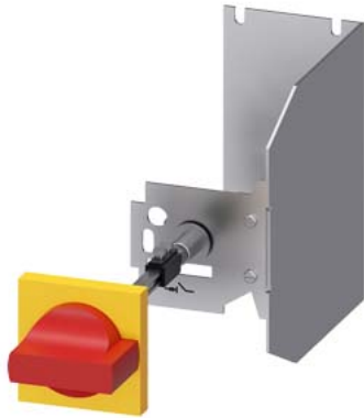
Door-coupling rotary operating mechanism for circuit breaker Size S2 Handle emergency switching-off new design