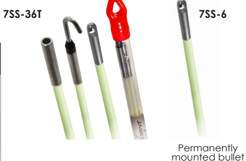
mounted bullet nose on each end.