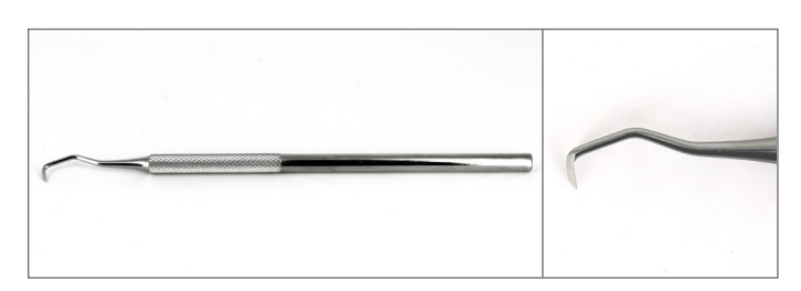
MPTSP5 Stainless steel probe - Triple bend tip