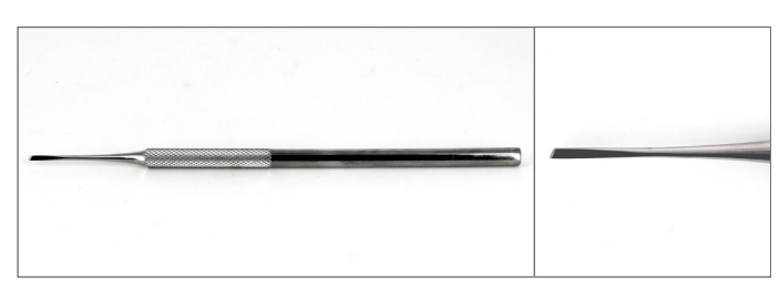
MPTSP6 Stainless steel probe - Flat tip