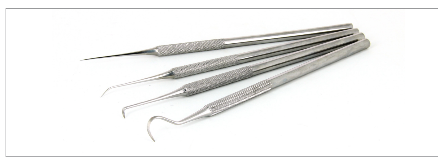
K4MPTSP Stainless steel probe - Kit of four styles (MPTSP1, MPTSP2, MPTSP3, MPTSP4)