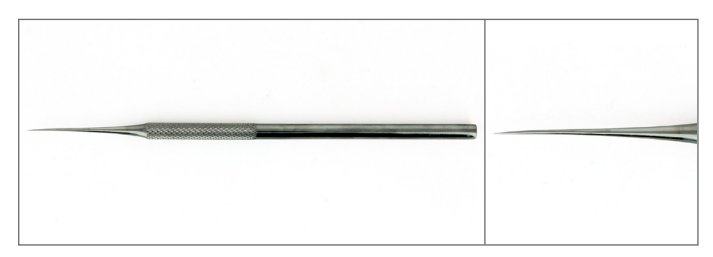
MPTSP1 Stainless steel probe - Straight needle tip