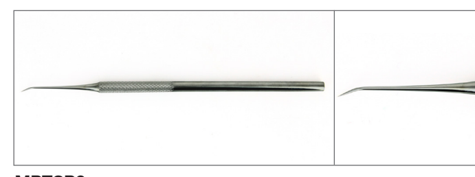
MPTSP2 Stainless steel probe - Angled needle tip