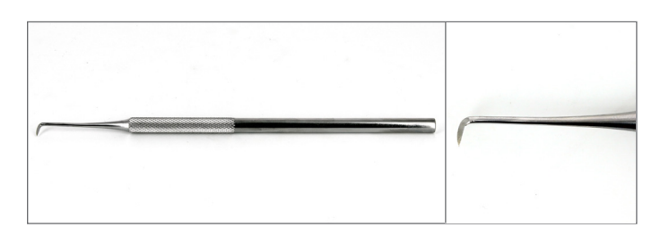
MPTSP3 Stainless steel probe - Single bend tip