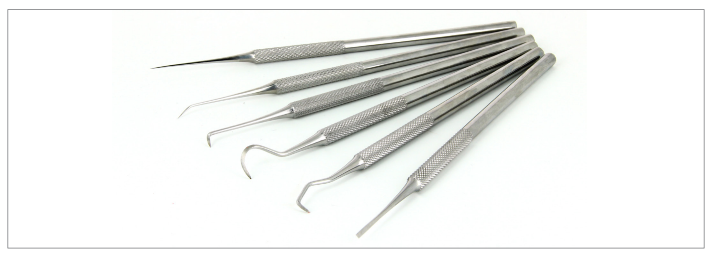
K6MPTSP Stainless steel probe - Kit of six styles (MPTSP1, MPTSP2, MPTSP3, MPTSP4, MPTSP5, MPTSP6)