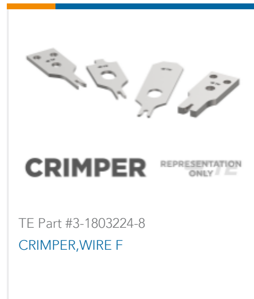
CRIMPER REPRESENTATION ONLY TE Part #3-1803224-8 CRIMPER, WIRE F