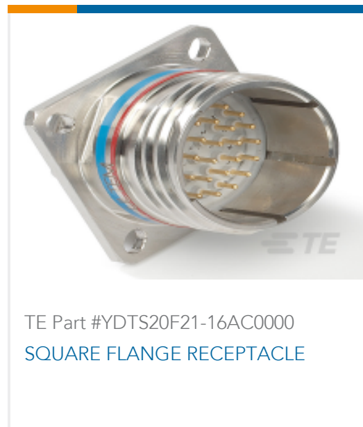
TE Part #YDTS20F21-16AC0000 SQUARE FLANGE RECEPTACLE