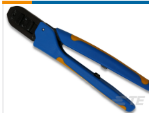
TE Part #2844982-1 CCII TYPE VI MLTIMATE PIN/SKT 22- 18 ASSY