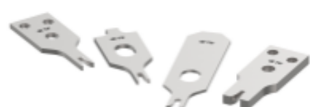
CRIMPER REPRESENTATION ONLY