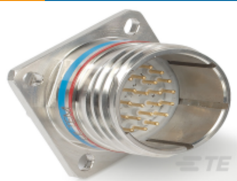
TE Part #YDTS20F21-16AC0000 SQUARE FLANGE RECEPTACLE