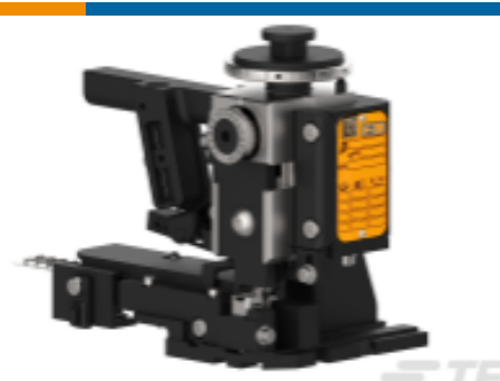
TE Part #2836167-1 OCEAN_2.0_Applicator-S-045F