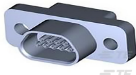
TE Part #1532177-1 M83513/04-G01N, MCKS-N1-B- 5156G1-18.0