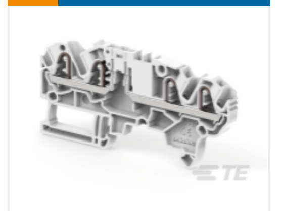
TE Part #1SNK705313R0000 ZK2.5-SP-4P