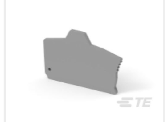
TE Part #1SNK705910R0000 EK2.5