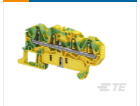
TE Part #1SNK705152R0000 ZK2.5-PE-4P