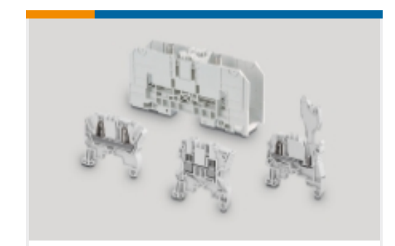
Modular Terminal Blocks(320)