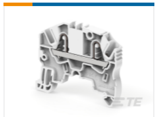
TE Part #1SNK705010R0000 ZK2.5