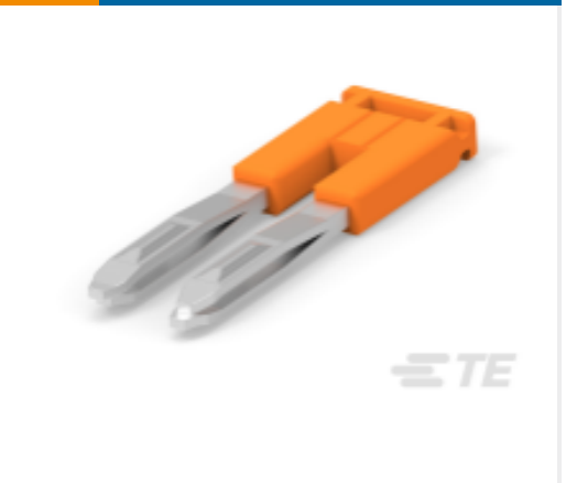
TE Part #1SNK906302R0000 JB6-2