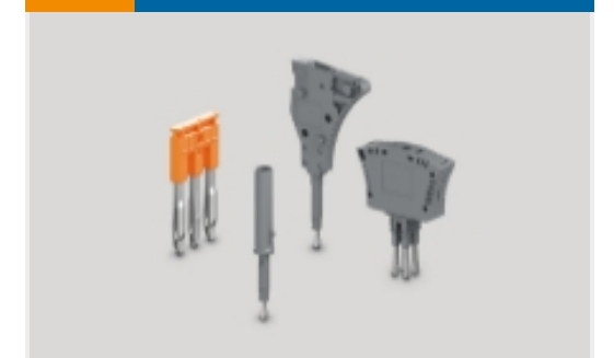
Terminal Block & Strip Conducting Accessories(67)