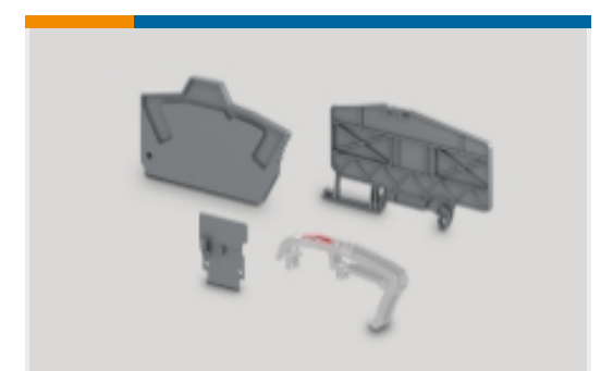
Terminal Block & Strip Insulating Accessories(31)