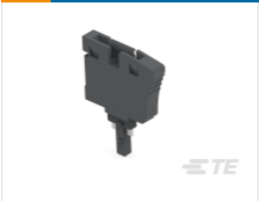
TE Part #1SNK900401R0000