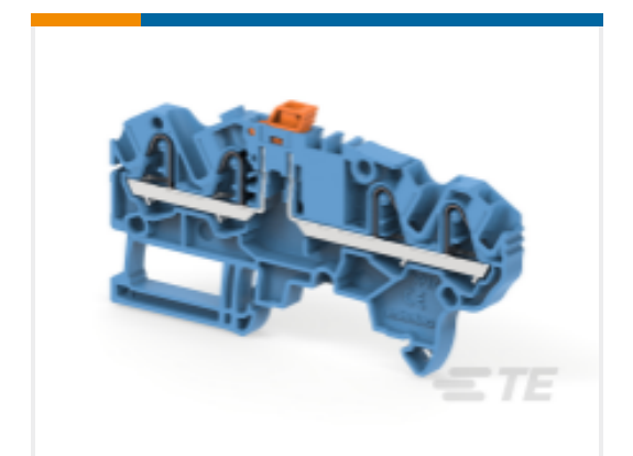
TE Part # 1SNK705321R0000 ZK2.5-S-4P-BL