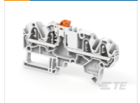
TE Part #1SNK705312R0000 ZK2.5-S-4P