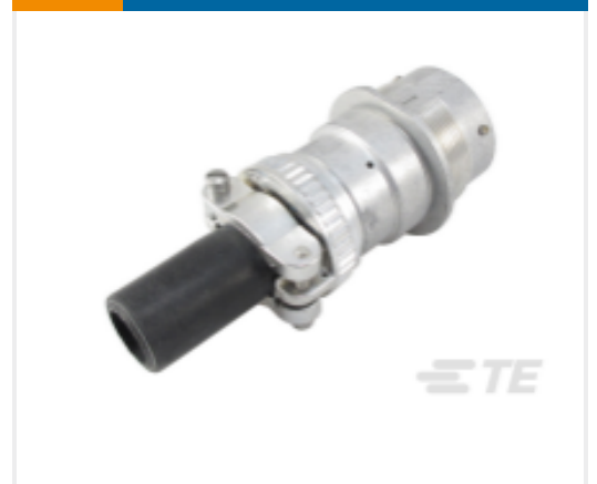
TE Part #HD34-24-19PN-059 REC,19P,AL,N,CBLCLMP BT,DRAIN,12 /16,P,MC