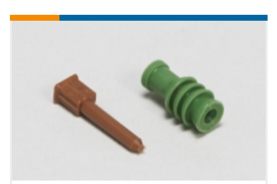
Automotive Seals & Cavity Plugs(6)