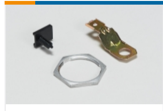
Other Automotive Connector Accessories(16)