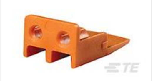
TE Part #WP-2S WEDGE LOCK, 2P, PLG, ORG, DTP