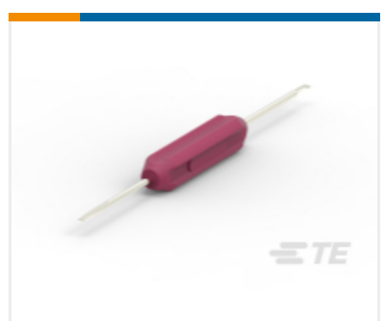
TE Part # DT-RT1 EXT TOOL, FRONT RELEASE