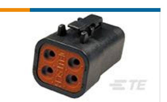
TE Part #DTP06-4S-E004 PLG, 4P, BLK, N