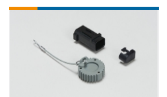
Automotive Connector Caps & Covers (1)