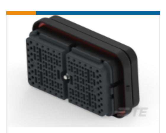
TE Part #DRB16-128SBE-L018 PLG, 128P, BLK, E, CAP, B