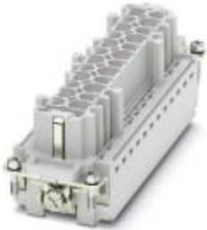
HEAVYCON socket insert, for 830 V (III/3), with 10 N/O contacts and 2 switch contacts, crimp connection

Please be informed that the data shown in this PDF Document is generated from our Online Catalog. Please find the complete data in the user's documentation. Our General Terms of Use for Downloads are valid ( http://phoenixcontact.com/download )