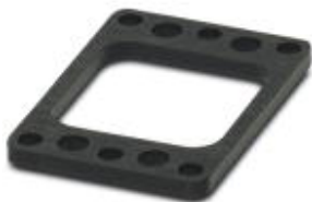
Replacement seal for HC-D7 housing

Please be informed that the data shown in this PDF Document is generated from our Online Catalog. Please find the complete data in the user's documentation. Our General Terms of Use for Downloads are valid ( http://phoenixcontact.com/download )