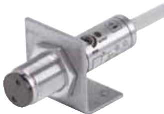
Sensor fitted inside the mounting aid

Using the mounting aid cylindrical sensors are fast and easy to fit. Use the nuts included with the sensor for attachment.