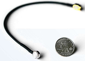
Compact ultrasonic sensor BHU100

BHU series ultrasonic sensors are built for structural health monitoring. They are based on piezoelectric and can be paired with ultrasonic scanner and receiver for structural integrity inspection. They are compact and protected with metal shells for long lasting life. They can be mounted on structure permanently with epoxy. BHU series ultrasonic sensors can be used with BroadScan ultrasonic scanner for structural health monitoring of metal or composite structures.