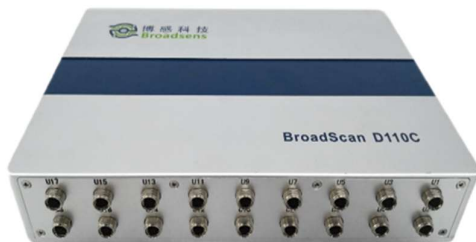
Ultrasonic scanner D110C