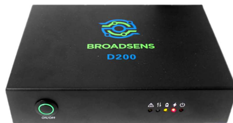
Ultrasonic scanner D200