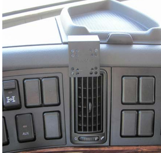
InDash installed showing South direction with 75006 part