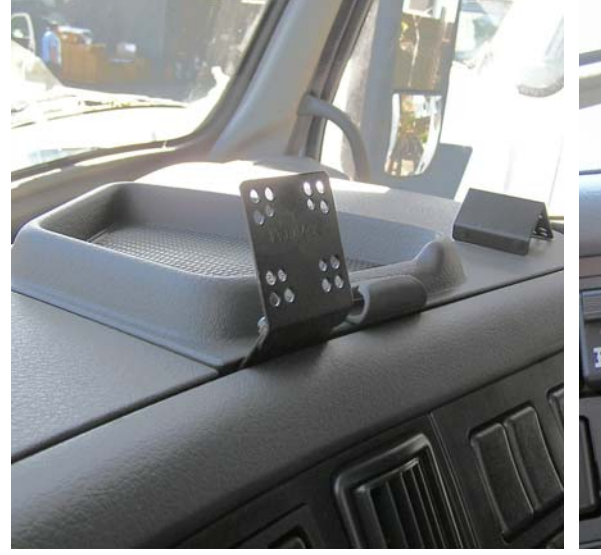
InDash installed showing North direction with 2-4 part