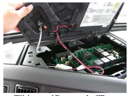
Tilting and Removal of Top