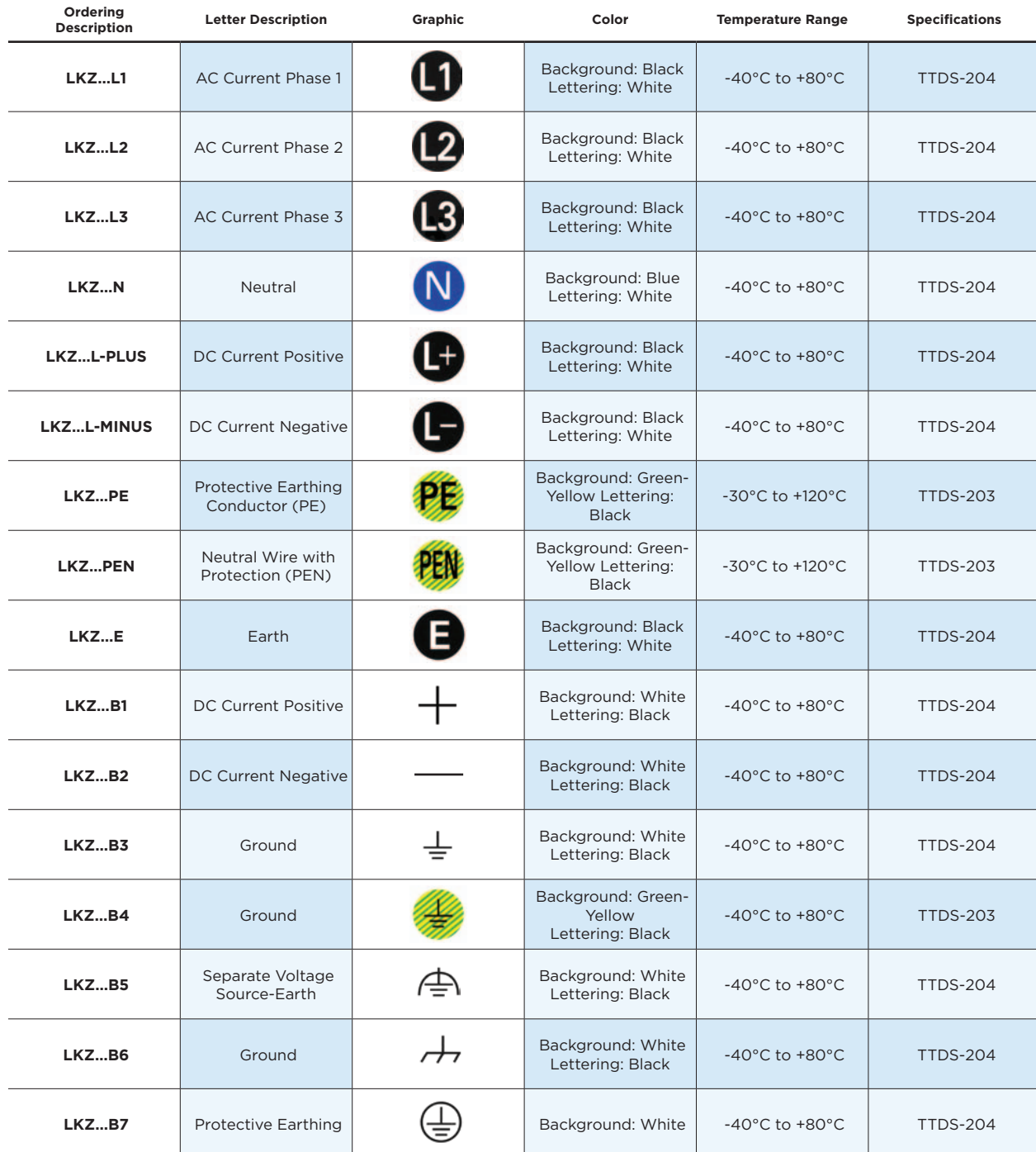
Electrical Symbols Part Number Chart

While TE has made every reasonable effort to ensure the accuracy of the information in this brochure, TE does not guarantee that it is error-free, nor does TE make any other representation, warranty or guarantee that the information is accurate, correct, reliable or current. TE reserves the right to make any adjustments to the information contained herein at any time without notice. TE expressly disclaims all implied warranties regarding the information contained herein, including, but not limited to, any implied warranties of merchantability or fitness for a particular purpose. The dimensions in this catalog are for reference purposes only and are subject to change without notice. Specifications are subject to change without notice. Consult TE for the latest dimensions and design specifications.